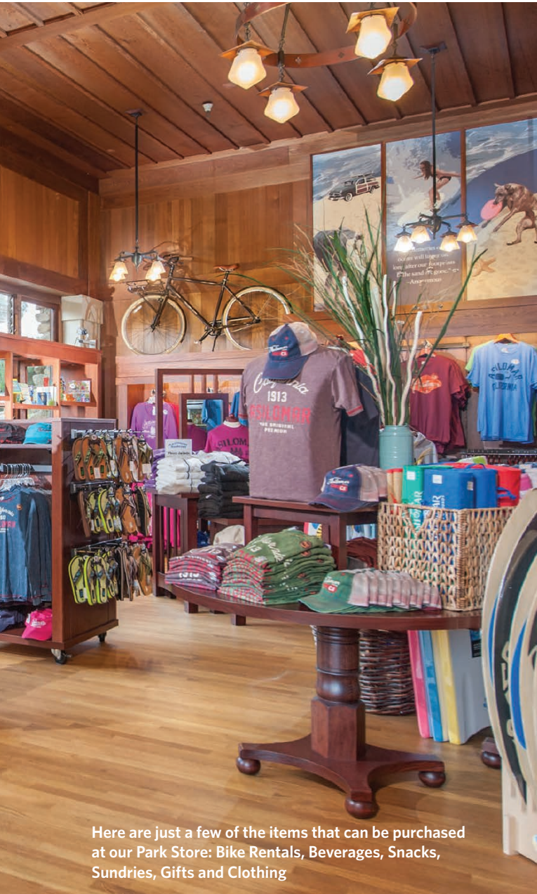
Here are just a few of the items that can be purchased at our Park Store: Bike Rentals, Beverages, Snacks, Sundries, Gifts and Clothing